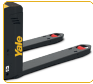
Entry roller for easy operation

Yale Europe Materials Handling Centennial House, Frimley Business Park, Frimley, Surrey GU16 7SG United Kingdom Tel: +44 (0) 1276 538500 Fax: +44 (0) 1276 538559