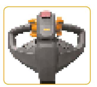
Handle (standard) Left and right handed